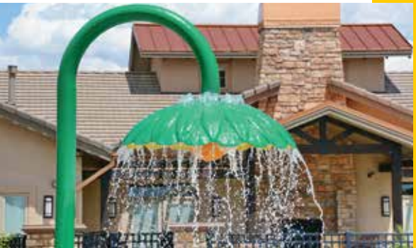
The Arboretum Pool & Clubhouse

Situated on more than four acres within the heart of the community, the Copperleaf Arboretum Pool & Clubhouse is designed for people of all ages to enjoy. Highlights include a six-lane, competition-size lap pool, a kid-friendly Splash Garden, a family-friendly Overlook Terrace and an adjacent pool house. Additional features include an expansive playground, a multi-sport outdoor court and a centerpiece Clubhouse. And, of course, the Arboretum Pool & Clubhouse features beautifully landscaped grounds for year-round enjoyment. This amenity is a favorite for all residents and has become the centerpiece for the community and the location for all community gatherings and events.