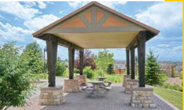
More than 100 acres of parks and open space, thousands of trees and miles of planned trails

At Copperleaf, thoughtful community planning, diverse resources and an ideal location blend together to create a unique and enriching foundation that makes it easy to feel connected to nature, your neighbors and your neighborhood. Around town, you'll find a wide range of local shops, restaurants and other helpful services. Plus, Copperleaf's ideal location along the E-470 corridor gives you easy access to a wealth of nearby conveniences like Denver International Airport (DIA), Southlands Shopping Center, Denver Tech Center, the Fitzsimmons Medical Research Center, various recreational destinations and much more.